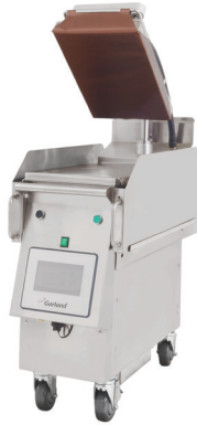
Model XPG12 Shown with straight grease cans